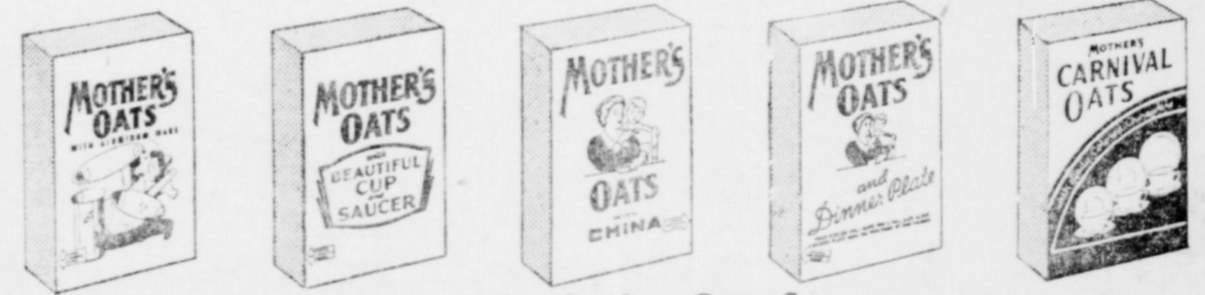
Products of The Quaker Oats Company

MOTHER'S OATS OFFERS YOU ALL-PURPOSE SELECTION OF DINNERWARE AND ALUMINUM KITCHEN UTENSILS