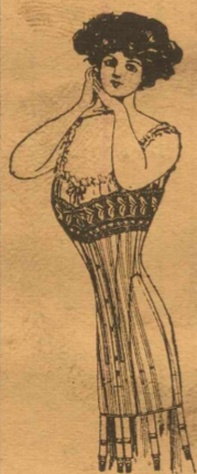
HENDERSON Fashion Form Corsets

$1.25 Waist trimmed in lace guaranteed to wash 89c