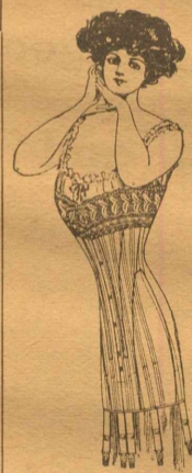
HENDERSON Fashion Form Corsets

3.00 Corsets 1.90 2.50 Corsets 1.79 2.00 Corsets 1.19 1.50 Corsets .75 5.00 petticoats, dark read, good width, this sale 3.50 1.00 white waist front emb, shadow and eyelet work .59 50c white waist front emb shadow and eyelet work .29