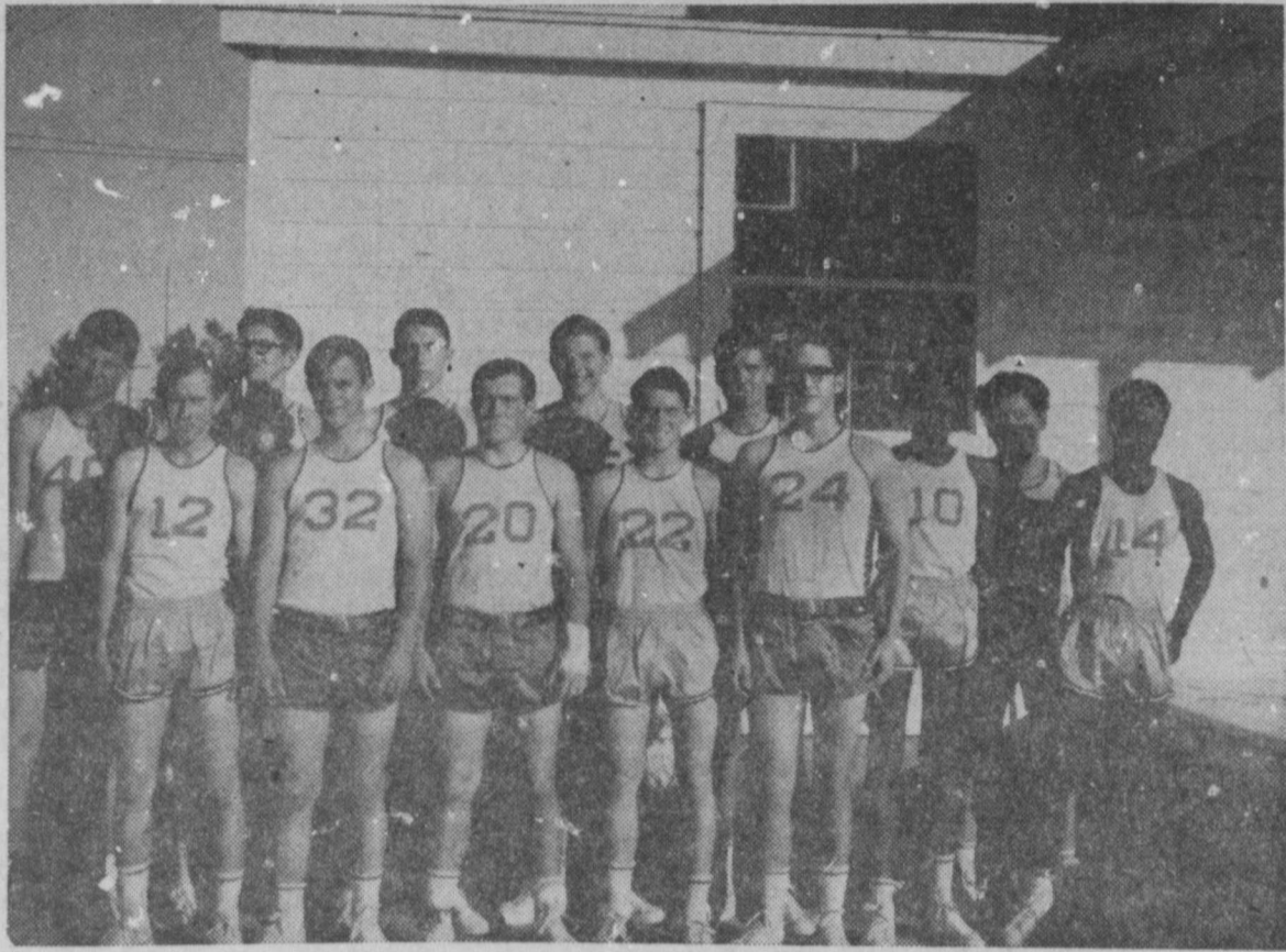
1968 - 69 BOYS BASKETBALL TEAM