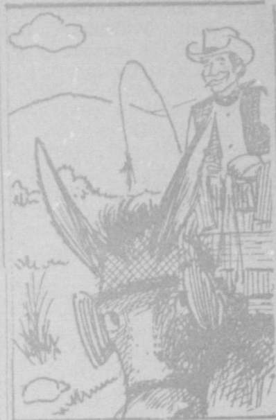
OL' MULE'S LAZY BUT SMART—KEEPS STOPPIN TO SEE IF HE HEARD ME SAY "WHOA"!

Game-bag tallies this fall will no doubt show more adults than juveniles, and we will be shooting off our capital stock instead of holding a reserve of the reduced po-