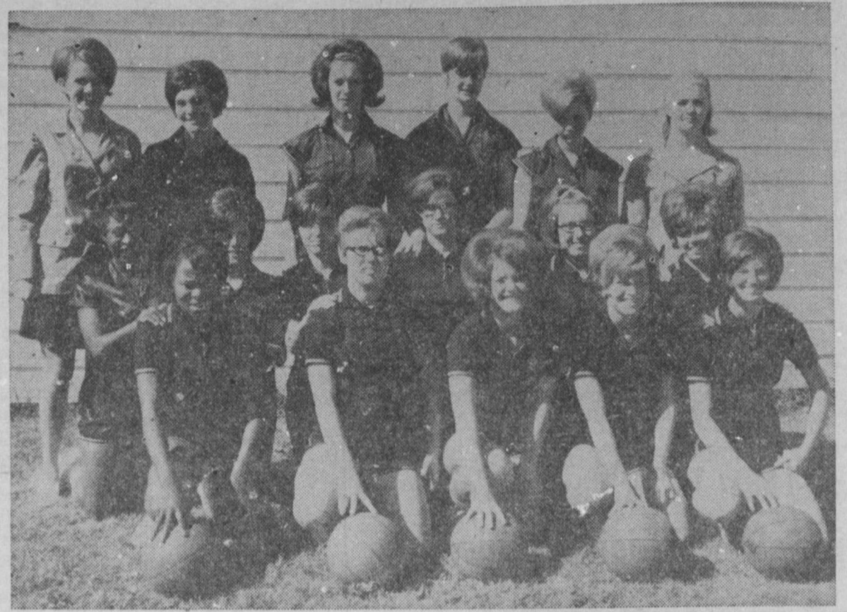
1968 - 69 GIRLS BASKETBALL TEAM