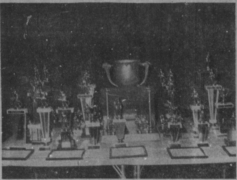
FIRE DEPARTMENT TROPHIES—Pictured here are some of the many trophies won by the Santa Anna Volunteer Fire Department and Ladies Auxiliary. Most of these trophies have been won the last few years. This is a very good example of how good our Fire Department and their Ladies Auxiliary really are.