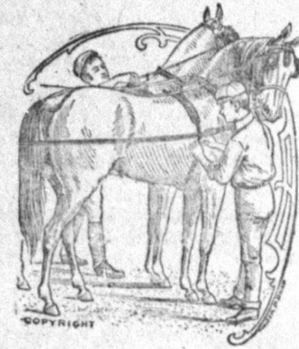
Figure With Me On Your Next Saddle

Would you prefer harness that is made to wear? Every stitch of our harness is right. We guarantee our harness, both the light and the heavy kinds. Our stylish harness is the best and the cheapest for driving. You can always depend upon it, and it costs the least