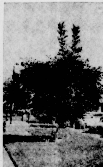
A CHARACTERISTIC—Common only to the rare Carpathian Walnut trees, two samples of which are found on the Eastland County Courthouse lawn, is the rapid growth of ones or more shoots in a short period of time. The two limbs rising high above this tree show the fast growth, and is