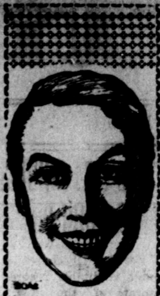
Mr. Good Merchant says: 'Wesell Good Goods; We Price Them Right.'

Our snappy spring dress goods come in the most beautiful designs we have ever had in our store.