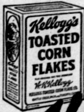
Don't forget, KELLOGG'S Corn Flakes are made by the folks who gave you the JUNGLELAND Moving Pictures. Coupon inside every package of KELLOGG'S Corn Flakes explains how you can obtain another copy of JUNGLELAND.

Be certain you get KELLOGG'S in the RED and GREEN package. It bears the signature of W. K. Kellogg, originator of Toasted Corn Flakes! None are genuine without it!