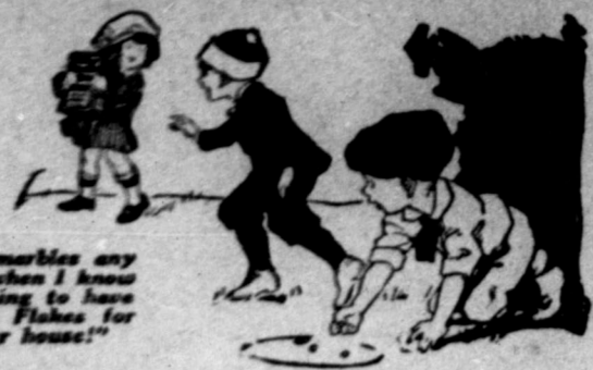
"I can't play marbles any longer, Patsy, when I know that we are going to have Kellogg's Corn Flakes for our lunch at our house!"