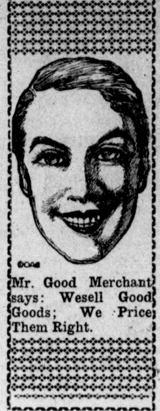
Mr. Good Merchant says: We sell Good Goods; We Price Them Right.

Don't suffer with the heat when you can be comfortable in a cool, summer dress. Come in today and select some of our lovely summer materials for your dress. These materials come in dainty, plain colors, others have almost invisible stripes through it, and others have flower scattered patterns. They are all beautiful and the last word in style.