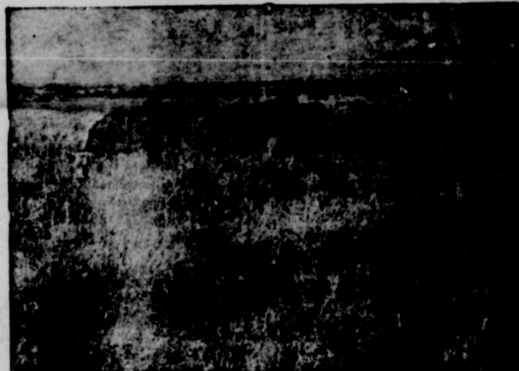
Terracing the land is a very profitable way for retaining spring rainfall