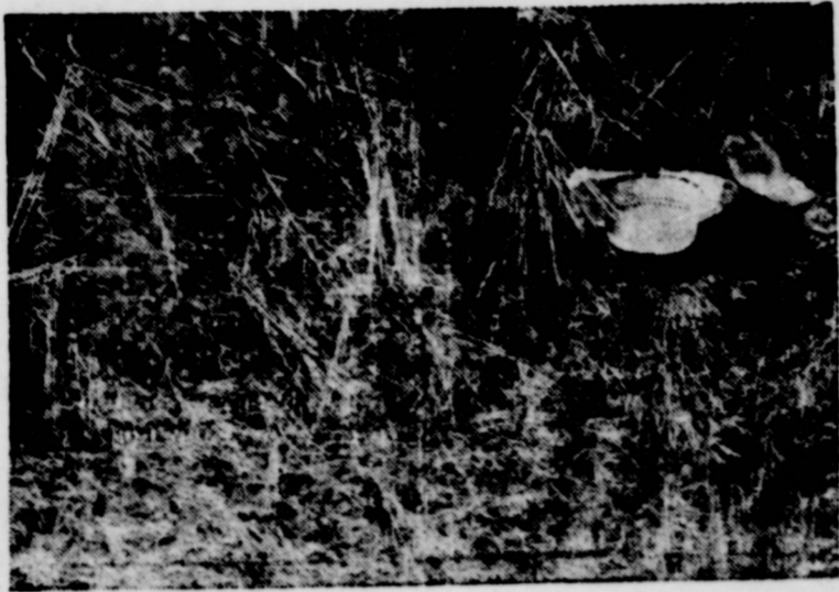
STUBBLE MULCHING ILLUSTRATED

There are exactly 100 varieties of cacti.