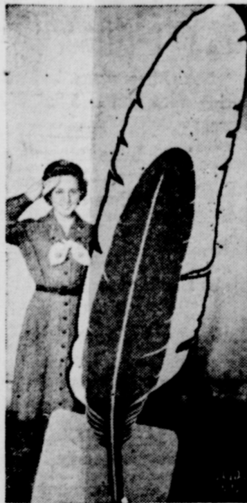
Girl Scouts all across the country salute the bigger Red Feather—symbol of the large scope of Community Chest activities made larger by the cooperation of all good citizens.

Complete Modern Funeral Home Including New Chapel Available Day or Night