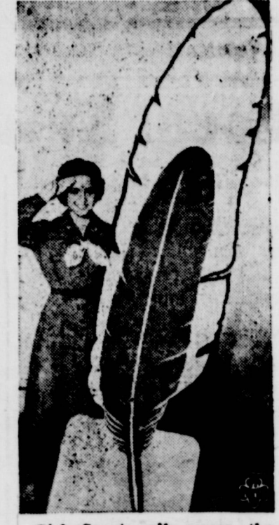
Girl Scouts all across the country salute the bigger Red Feather—symbol of the large scope of Community Chest activities made larger by the cooperation of all good citizens,

Have YOU Tried The Friendly - Competent - Convenient Banking Service Offered By The