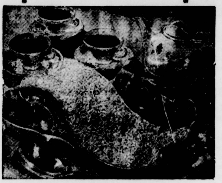
Almond Chicken With Rice

Chinese Chicken Almond With Rice, a delightful delicately flavored dish with chicken, celery topping, is sure to please your family. It makes an attractive "one main dish type mea!" and is easily served to a crowd.