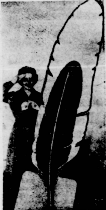
Girl Scouts all across the country salute the bigger Red Feather—symbol of the large scope of Community Chest activities made larger by the cooperation of all good citizens.