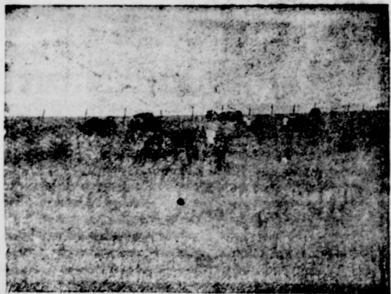
Proper stocking of Range and Pasture lands helps to get a cover of desirable grasses.

Inquire about our Turkey Finance Plan Come to see us — Let's Get Acquainted