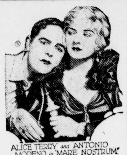
At the Queen Theatre, Monday and Tuesday, June 20 and 21.