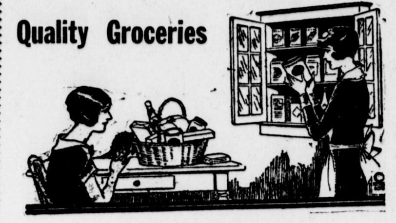
At Prices That Save

It's a grand combination for any housewife to get foodstuffs that are of the highest grade at prices that offer the utmost for the amount spent. You will appreciate more fully what we mean by giving us your grocery orders this month.