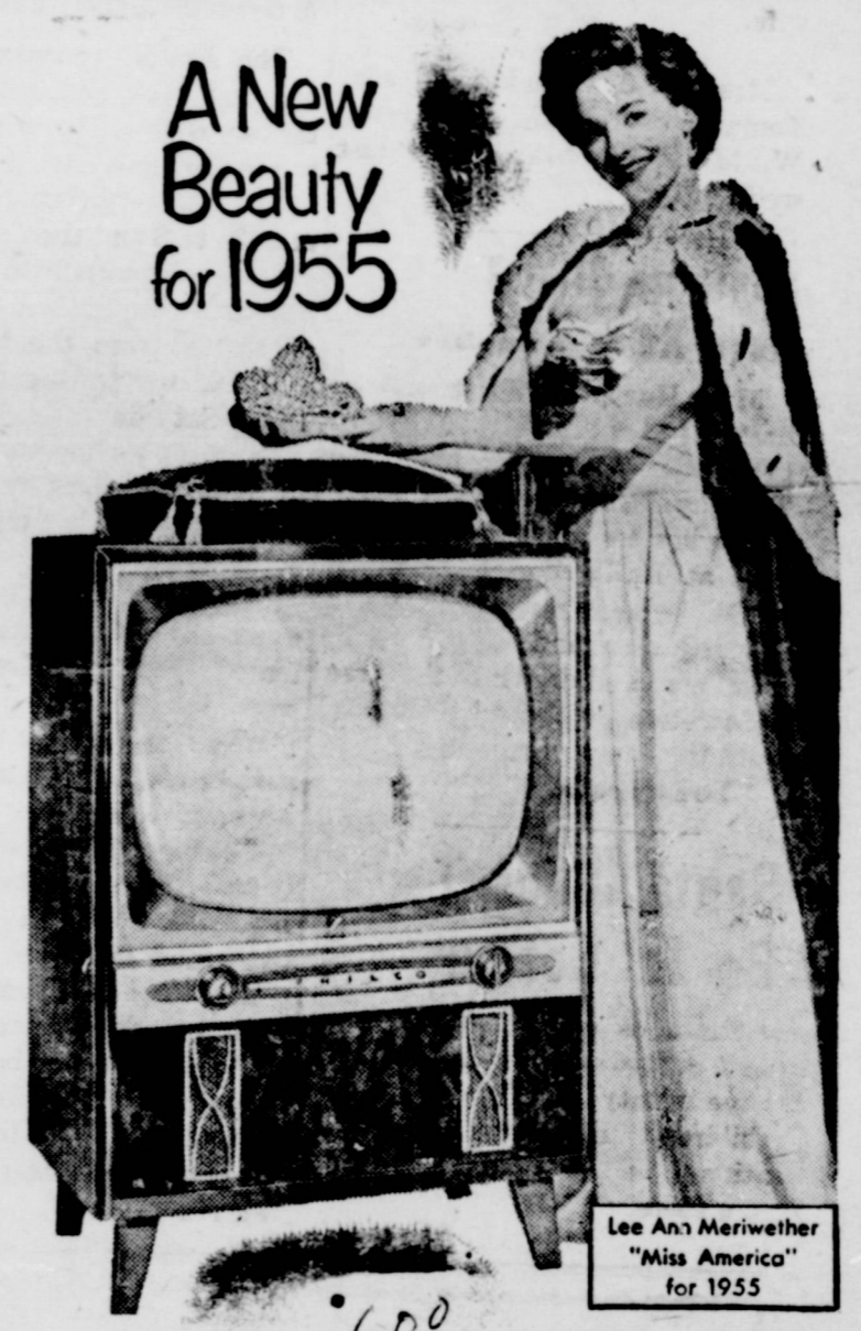
Lee Ann Meriwether "Miss America" for 1955

The exquisite 24-inch PHILCO "Miss America"