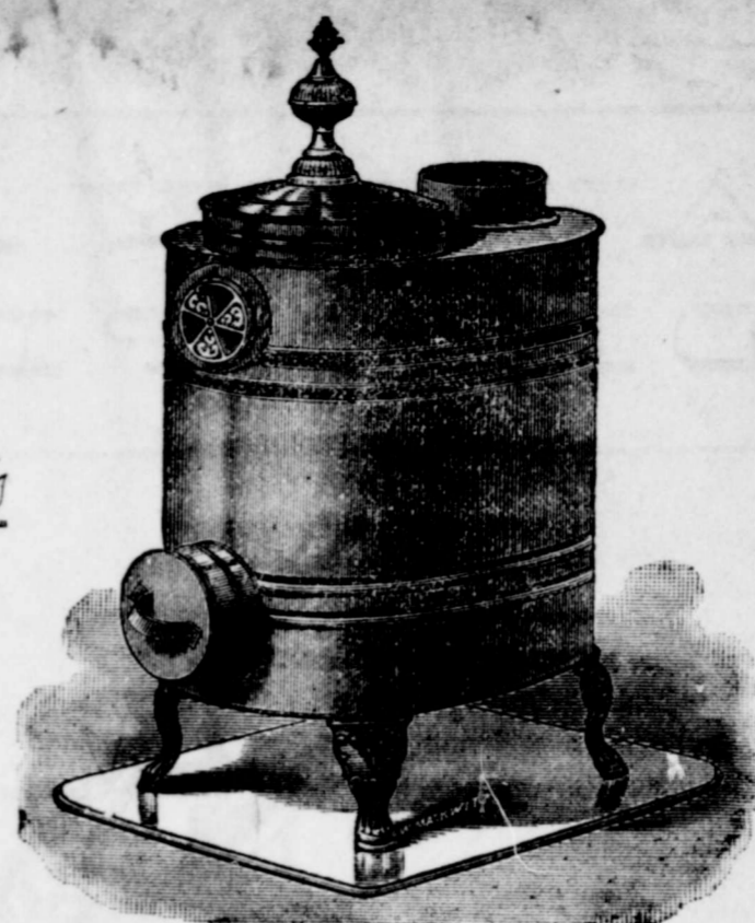
AIR TIGHT HEATERS

The above stoves are unequalled. We invite inspection. Any size. We also have a full line of Coal Stoves, Superior and Charter Oak Cook Stoves. Visit our store and let us show you why these stoves are better than others.