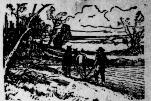
The American Farmer the Best in the World