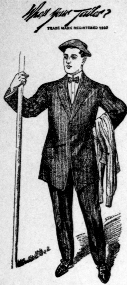
Design 561 Three Button Novelty Sack, dip front, slanting buttonholes.