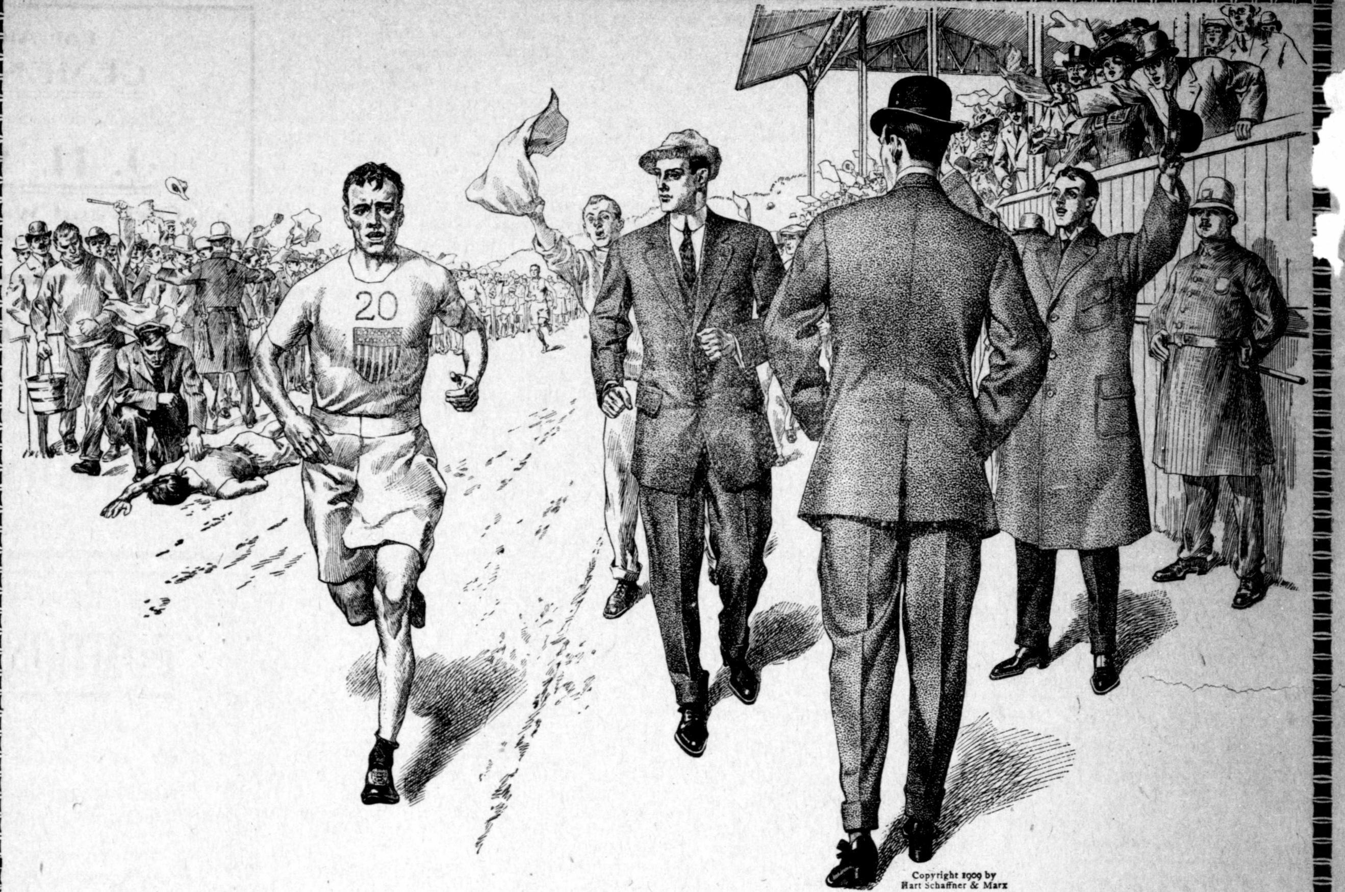
Copyright 1909 by Hart Schaffner & Marx

Prices are right at Bartlett's Photo Studio. tf