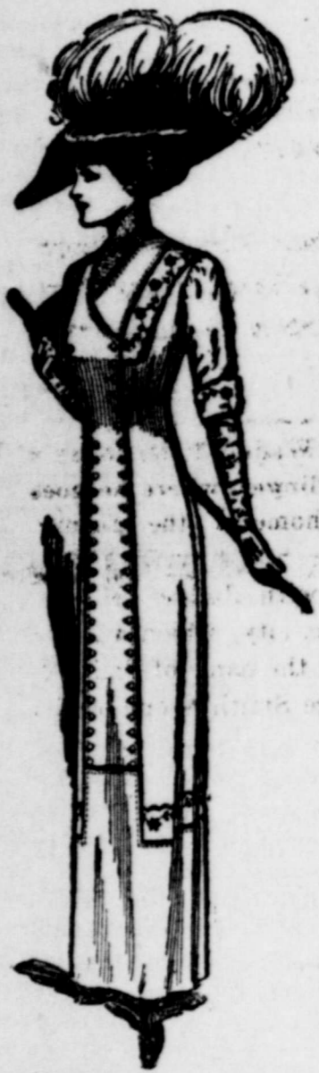
Call Pattern No. 385 Price, 15 cents A CHARMING COSTUME

of dainty White and Colored Wash Goods are now open and ready for your inspection. Notwithstanding the backwardness of the past season you will find our stocks full and overflowing with everything that is new.