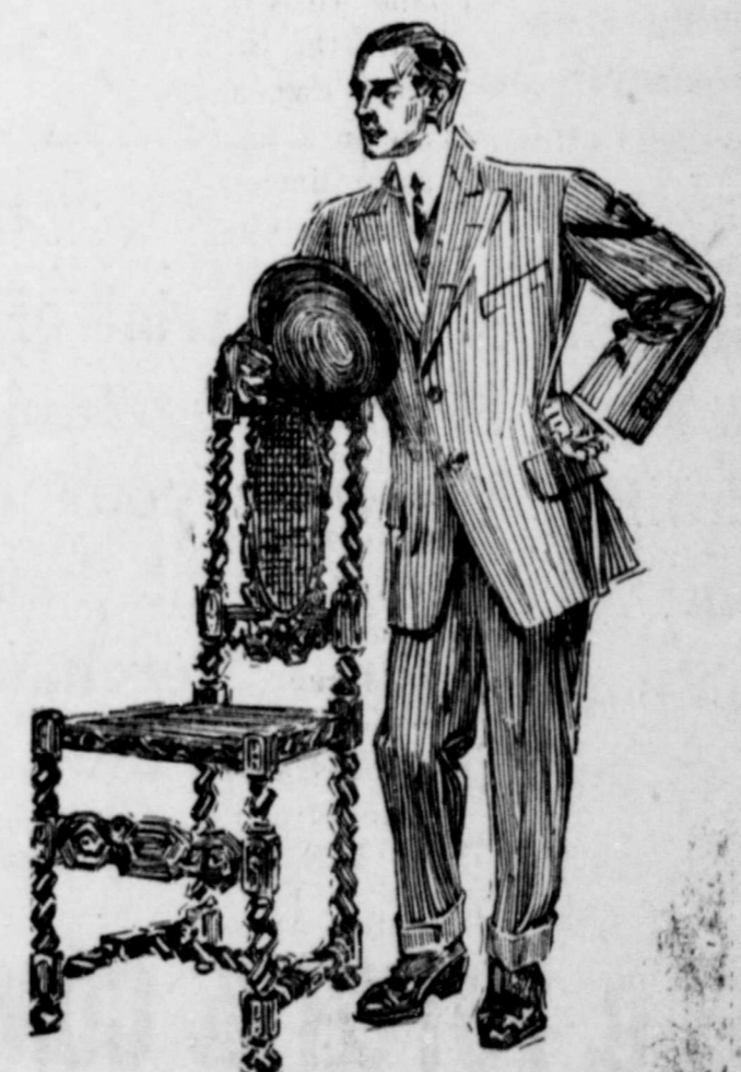
Copyright 1910 The House of Kuppenheimer Chicago