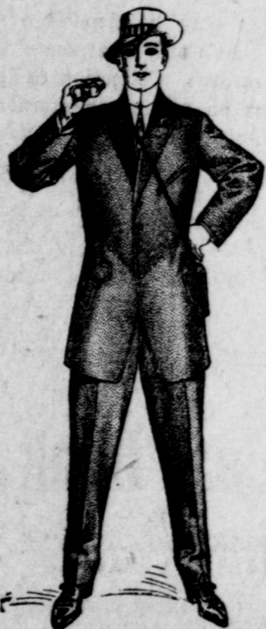
Four-Button Novelty Sack, No. 712

WOULDN'T you be willing to wait a few days for your new clothes order to have them made you want them for practically the price of a ready-made? Our modern Chicago