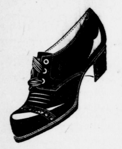
This Shoe Sale Will be The Talk of The Town