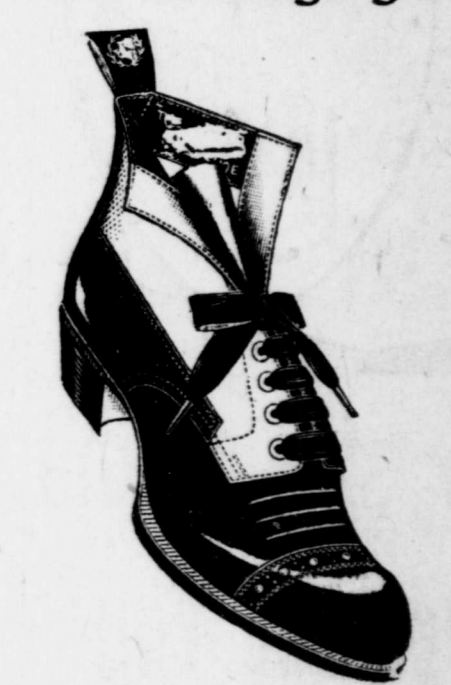
Out of The Ordinary Offerings