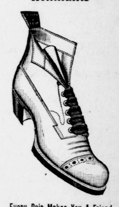
Every Pair Makes You A Friend

"Quaker Lady" Collars Coat Lapel Jabots Byzantine Collars and Fichus