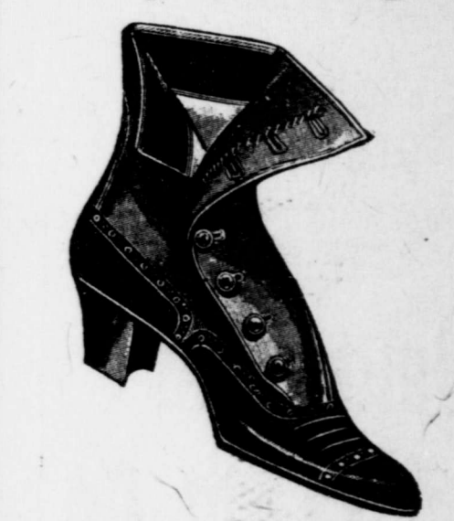
NOW You Get The Pick--LATER You Get The Remnants