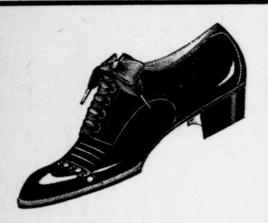
Out They Go All Summer Shoes

No carrying over of Summer Stocks. No place to store them, if we cared to. But the price reductions must solve the problem of economical importance. Now are the saving opportunities offered in Men's, Women's and Children's Spring Low Cuts. This Final Clean Up Sale means that we will put such low prices on every pair of Summer Shoes that every pair will be snapped up quickly.