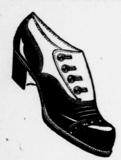
Better Lay In A Supply Now