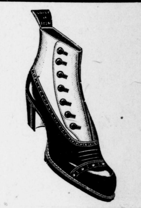
Shoe Prices That Talk All Languages

During this Final Clean up Shoe Sale we will sell you any $2.45 $5.00, $6.00, $7.50 or $8.00 Lingerie Dress at : : : : $2.45 You can well afford to buy several at this Price