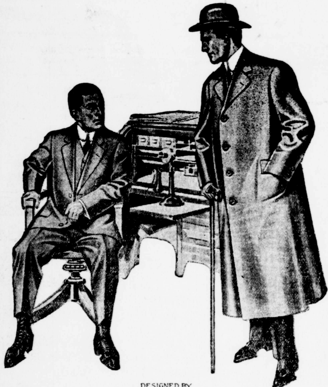
DESIGNED BY SPERO, MICHAEL & SON NEW YORK

You will find our preparations for your Clothes needs so complete that there's nothing left to be discussed. We have every good style. These Hart, Schaffner & Marx Suits and Overcoats are different from any others. New in design, New in color, pattern, weave; things especially selected for men who want the best. The all-wool quality is in them, of course, and the fine tailoring.