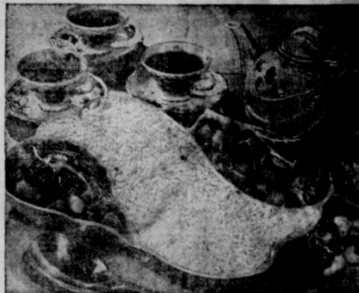
Almond Chicken With Rice

Chinese Chicken Almond With Rice, a delightful delicately flavored dish with chicken, celery topping, is sure to please your family. It makes an attractive "one main dish type meal" and is easily served to a crowd.