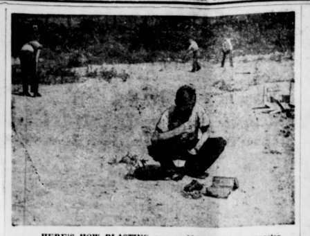
HERE'S HOW BLASTING cap accidents start—a youngster ids a deceptively harmless-looking lot of shiny tubes lost from construction job or mine operation.