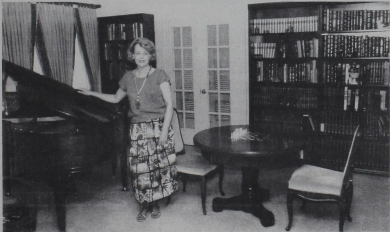
Home sweet home

Hogan said she hopes the city will approve signs at every neighborhood street corner declaring the area a historical district.