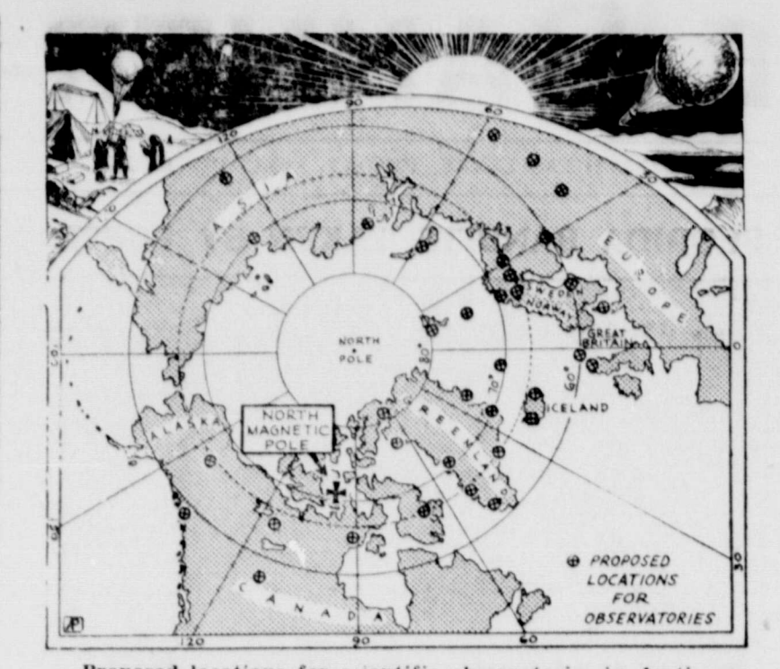
Proposed locations for scientific observatories in Arctic regions for the polar year 1932-33 are indicated by this map. A few observatories also will be established in Antarctic region.

announced a racing card to be which will insure the surfacing of north and south magnetic poles if the balloons are lost.