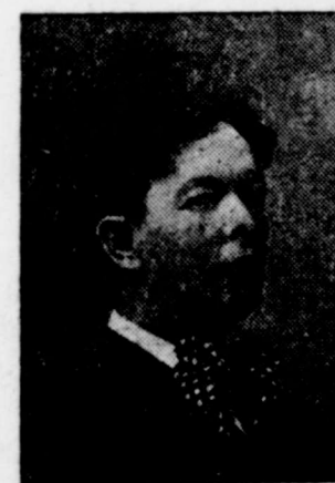
In VAUDEVILLE WHITE CITY

Quite a number of the Ballinger school boys left Monday morning for Valley creek, where they will bale hay for a week or two.