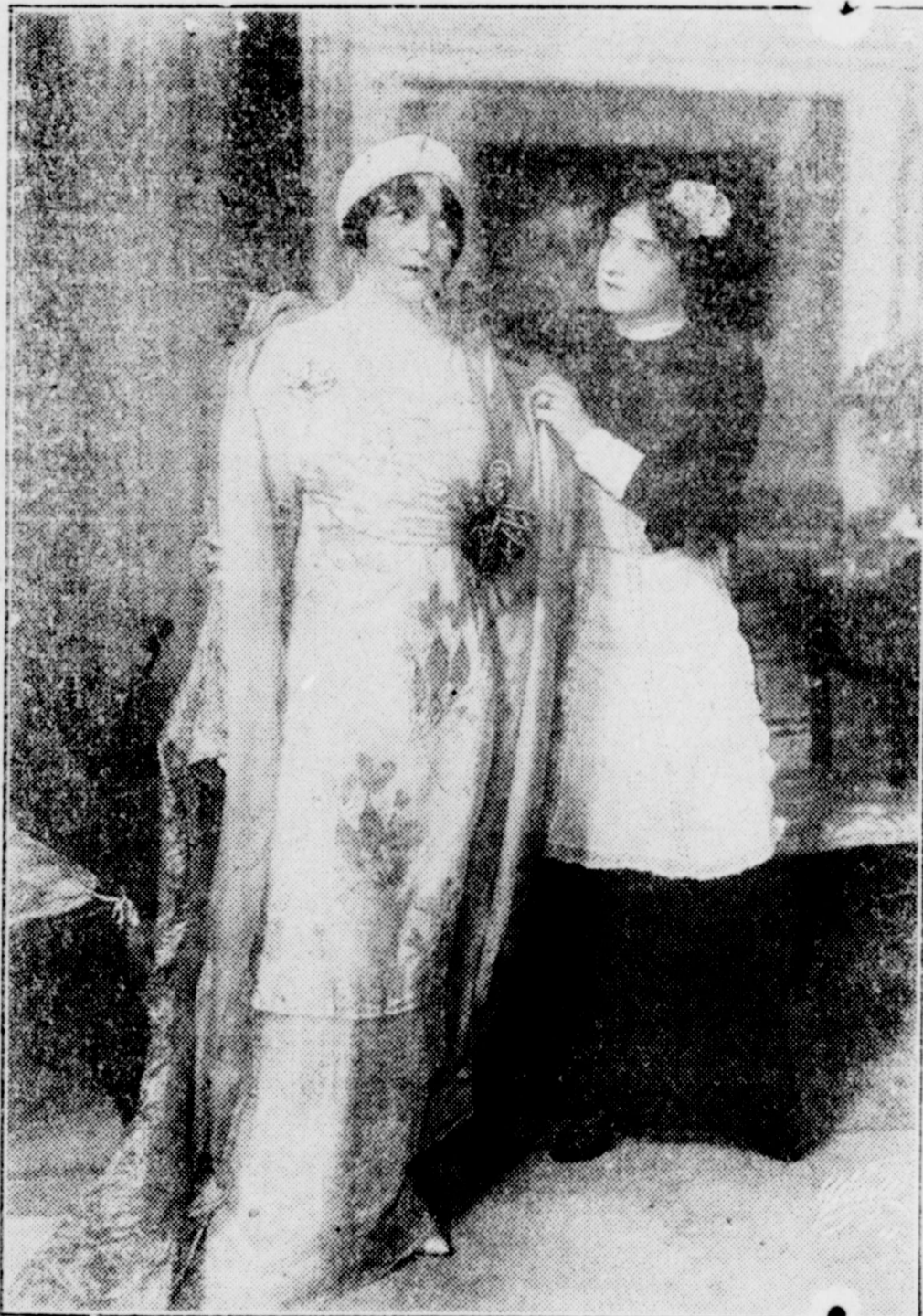
Scene from Geo. M. Cohan's Musical Success "The Little Millionaire," Opera House Wednesday March 4th.