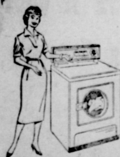
LIVE BETTER ELECTRICALLY - dry clothes for an average of about 5c a load in an Electric Clothes Dryer.

No more hanging clothes outside to dry when you have an Electric Clothes Dryer