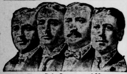
Gentry Bros. Sole Owners and Managers.

The 33rd Anniversary of America's Standard Tented Enterprise, now presenting the Blue-Blooded Aristocracy of the Equine and Canine Worlds.