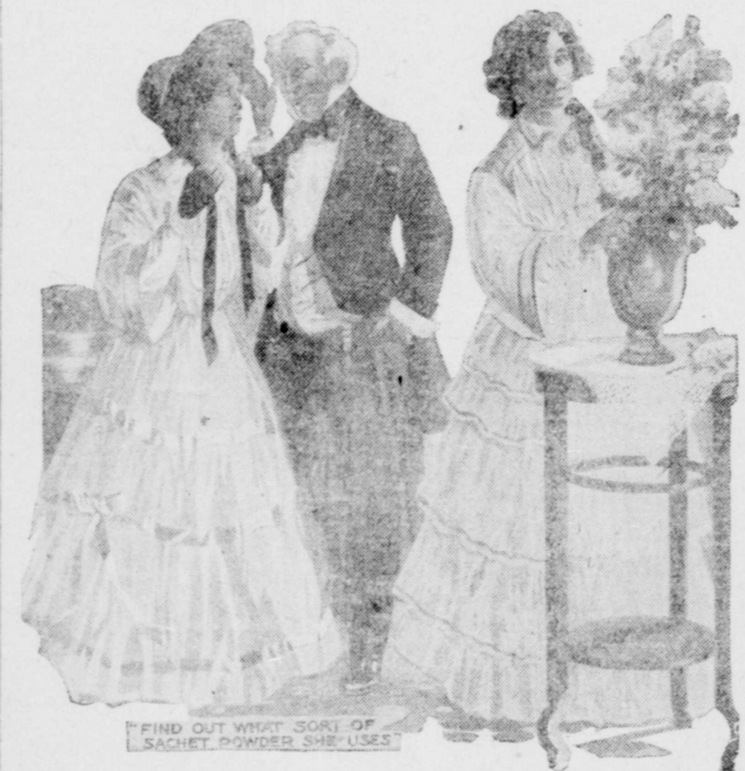
Scene from "Barriers Burned Away" at Princess Theatre tomorrow night, presented by Gilson-Bradfield Stock Co.

Coming-- "THE TREY O' HEARTS" Read the Story in the Leading Papers.