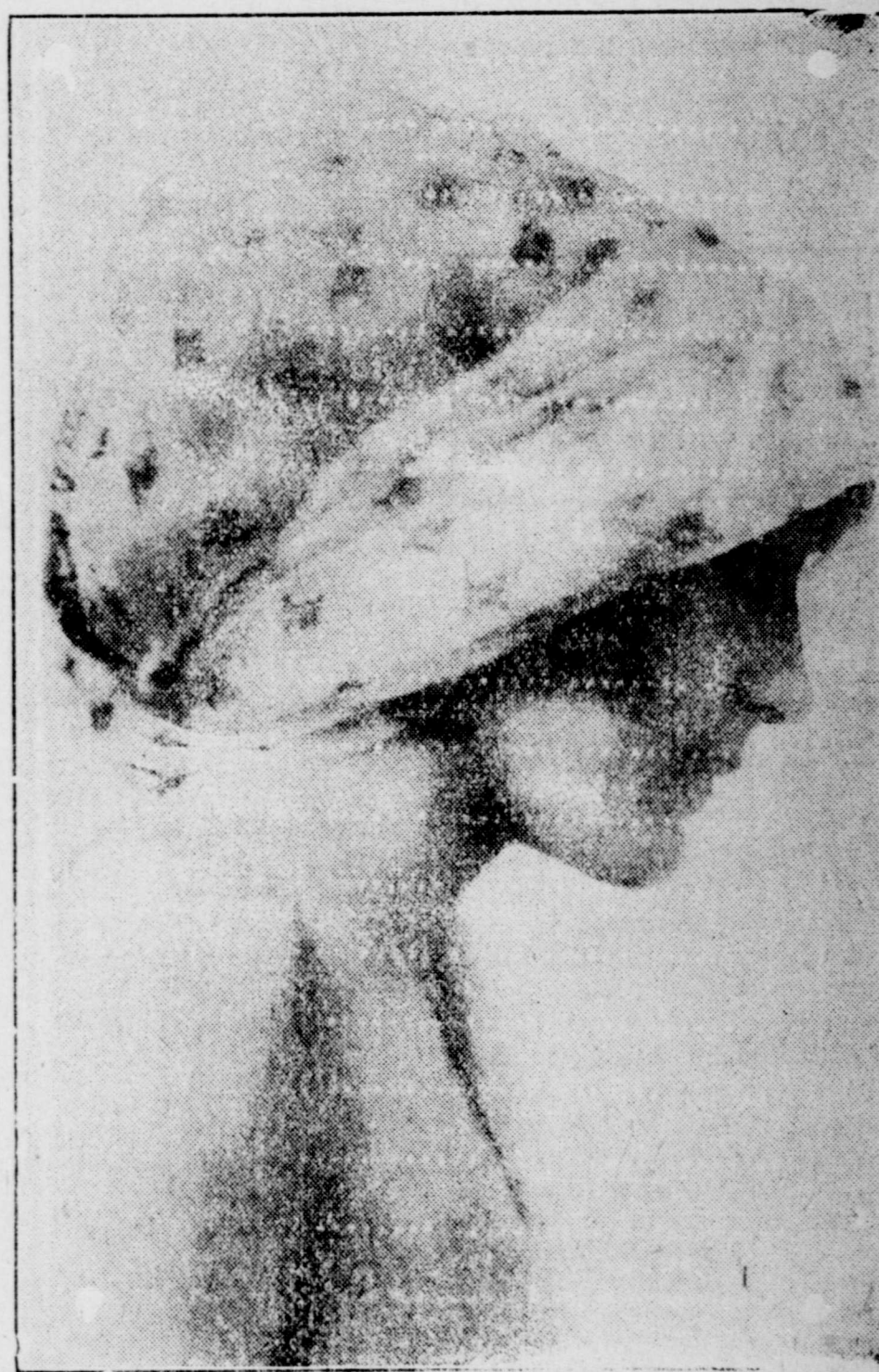
"NEPTUNES DAUGHTER" Princess Theatre Wednesday, Dec. 9