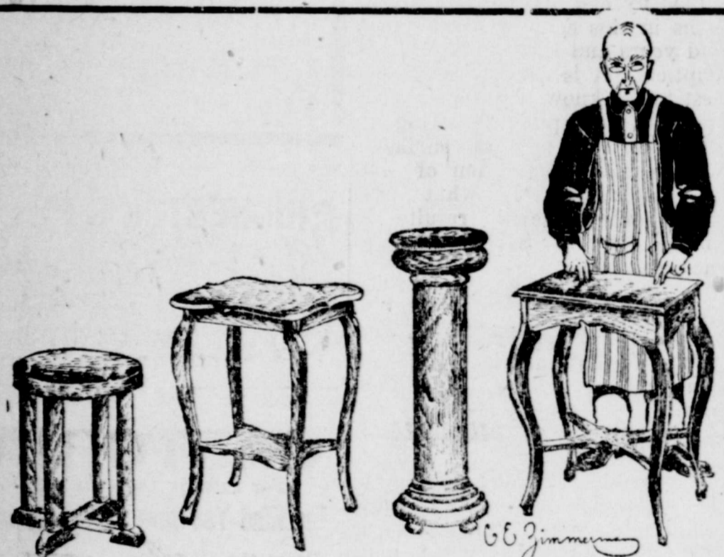
Copyright 1909, by C. E. Zimmerman Co.—No. 58