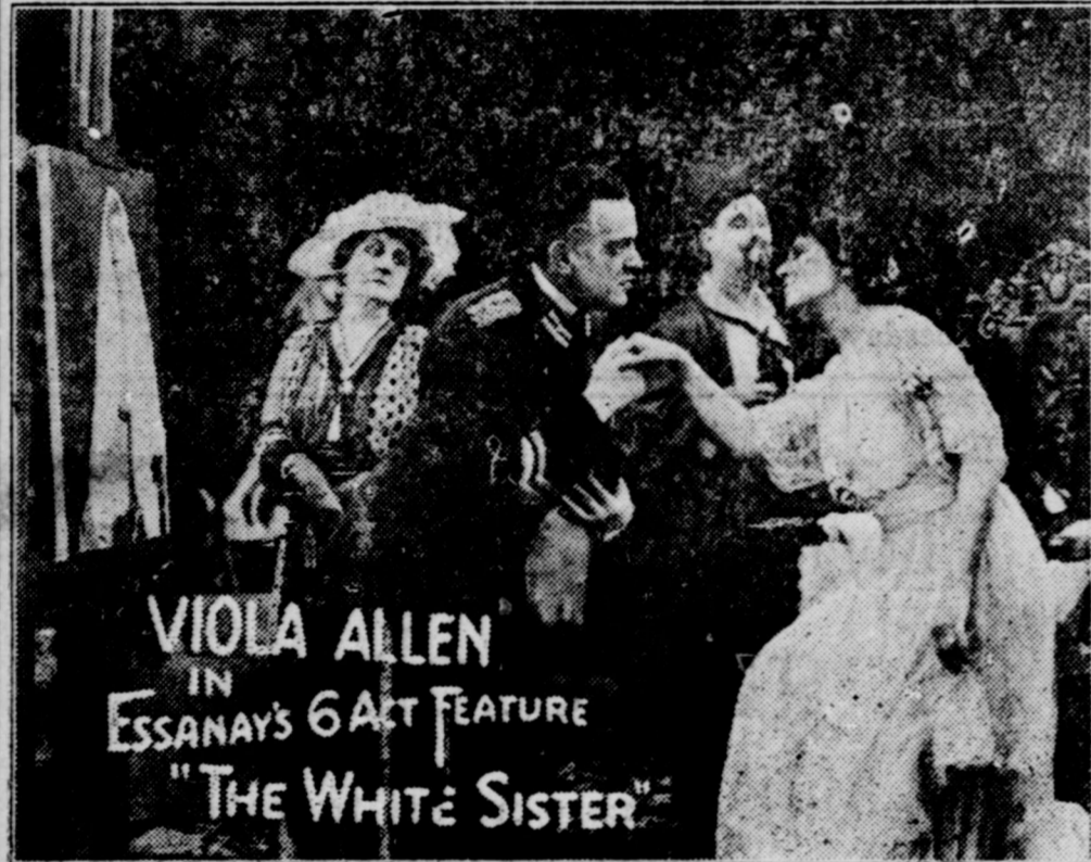
VIOLA ALLEN IN ESSANAY'S 6 ACT FEATURE "THE WHITE SISTER"

V. L. S. E. Inc., Proffers F. Marion Crawfords Marvelous Novel