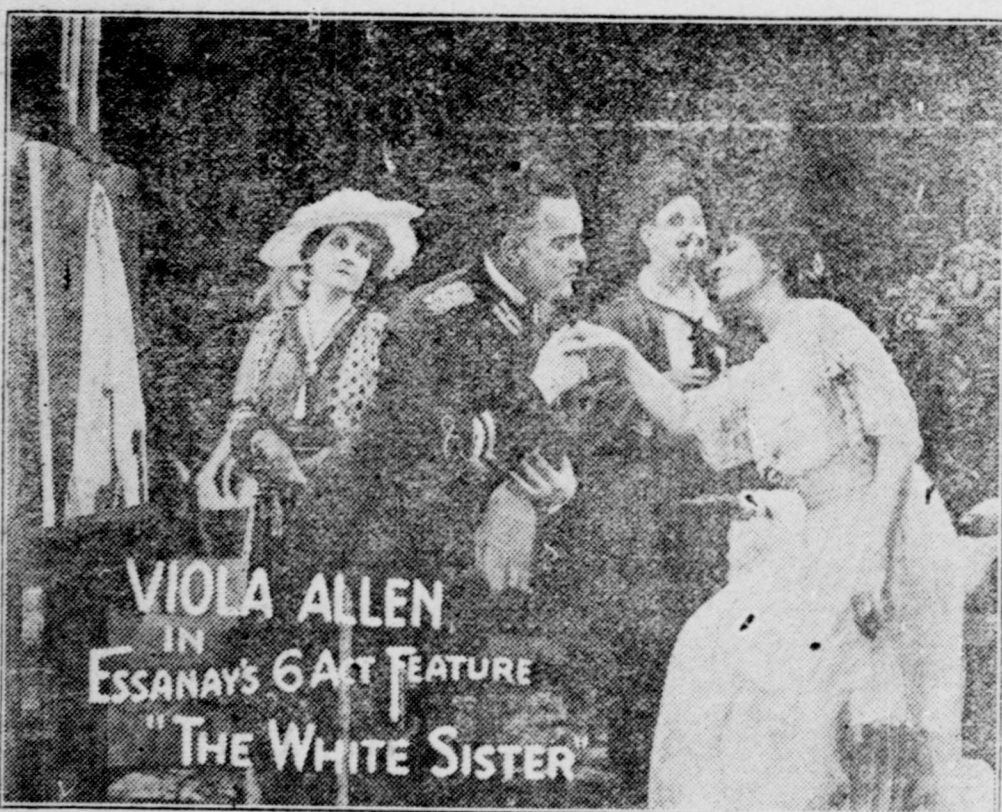
VIOLA ALLEN IN ESSANAY'S 6 ACT FEATURE "THE WHITE SISTER"

TONIGHT V. L. S. E. Inc., Proffers F. Marion Crawford's Marvelous Novel