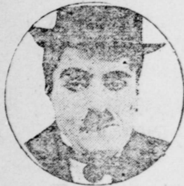
Coming Saturday, Jan. 22 Chas. Chaplin, in "SHANGHAIED"