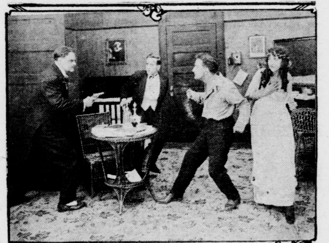
SCENE FROM "THE NET OF DECEIT"