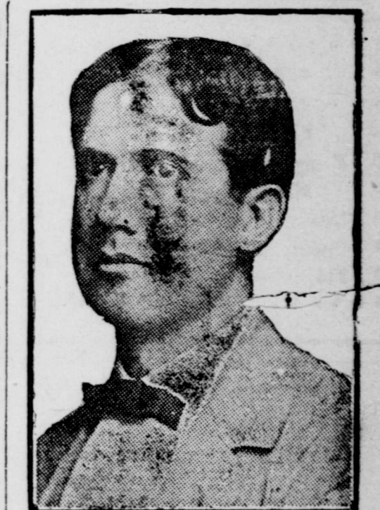
Hon. Wm. P. Hobby, Lt. Gov.

Dallas, Tex., Jan. 12.—Lieut. Gov. W. P. Hobby of Beaumont, here today re-election. He told newspaper men that although it was too early to make formal announcement "the people should know what my intention are."