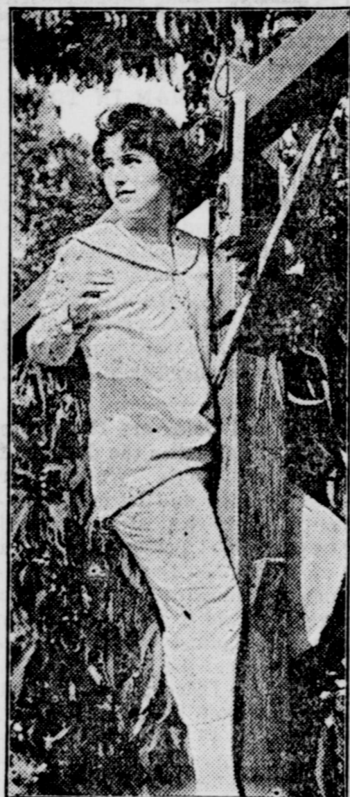
Helen Attached Her Instrument and Sent a Hurry-Up Message.

Helen and Storm found Rhineland hard at work. It was the first time he had seen Storm since the night on the launch and he greeted his visitors with a hearty laugh. “Licked?” He echoed, after Helen had repeated her companion's threats. “Why, George, I could whip my weight in wildcats this morning. I'll have steel half way up the pass if I can get hold of a few cars of ties this week. And something always happens when I feel this way. I'll tell you right now,” he pointed a stubby finger at Storm, “it's up to you.