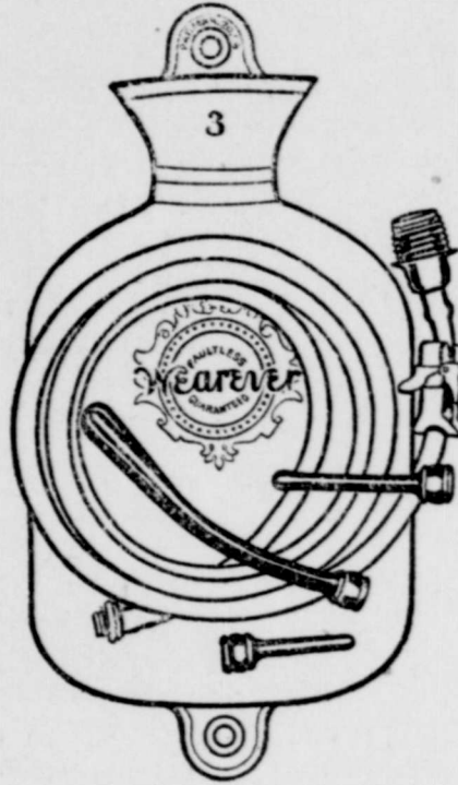
"WEAREVER" Household Rubber Gloves

Protection against stained red, rough hands. Useful for housework; comfort to wear. Very finest quality and guaranteed. We fit you perfectly. Pair, $1.00.