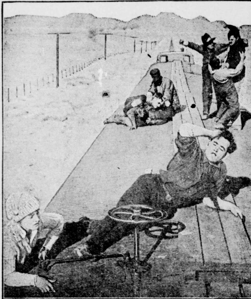
The Fight on Top of the Train Was Vicious.

Bill and Lug, dragging the fat guard down hill, hid him in a ravine near the side track. The two then hiding in turn, watched the train as it stopped at the station below. The agent came out of the office after a few minutes. When the conductor asked about the car the agent and he walked together over to it. They saw it would not be ready to start for some time. The predicament in which the thieves now found themselves was an awkward one. They knew full well that Storm, the minute the escaped guard reached the mine, would be after them with men as fast as horses could travel.