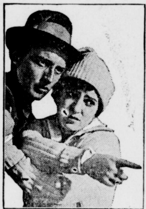
Helen Told of the Disaster.

"I have understood," he began, "there has been some criticism of my action in disposing of the Superstition mine to the Copper Range and Tidewater people. Some of our stockholders have been unkind enough to hint