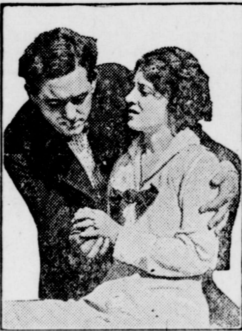
"Can You Forgive Me?"

canyons and foothills of the San Pablo valley.