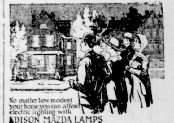
ADISON MAZDA LAMPS

Because your house is not wired is no reason why you should abandon the idea of using