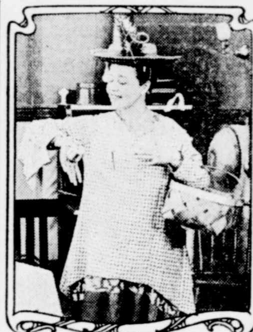
SIS HOPKINS IN A "LUCKY MISTAKE"

To tel the truth, girls, there ain't much more to write about Etiket. It's jst a hard way of doing coz things. Suposin' you want to send the hired man over to Sarah Spinks to berry her ice creme freezer becuz you're going