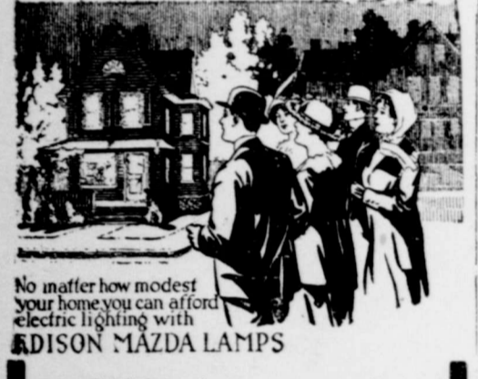
No matter how modest your home you can afford electric lighting with EDISON MAZDA LAMPS

LONG winter evenings will soon be here, the time when comfort and cheer are most welcome.