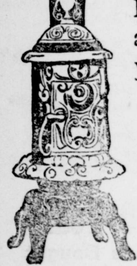
OLD STYLE STOVE

We are going to close up shop when the time comes that we cannot look you in the face and say, "There's Honest Values and Honest Prices." Our large line of Cole's Heating Stoves is not only attractive but will save you one-third your fuel bill.