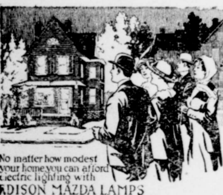
NO MATTER HOW MODEST YOUR HOME YOU CAN AFFORD CERTIFICATES LIGHTING WITH MADISON MAZDA LAMPS

LONG winter evenings will soon be here, the time when comfort and cheer are most welcome.