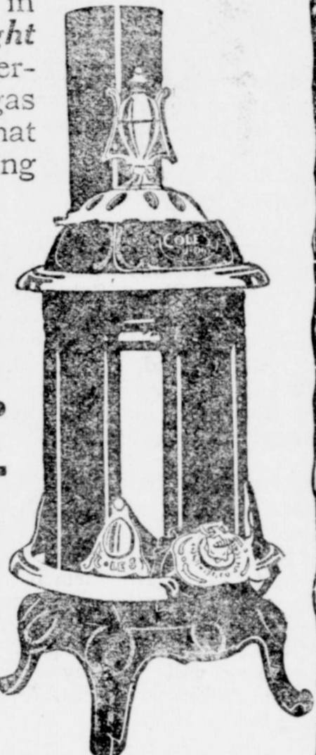
Look for the name "Cole's" on fuel door. None genuine without it

"Cole's Hot Blast Makes Your Coal Pile Last"