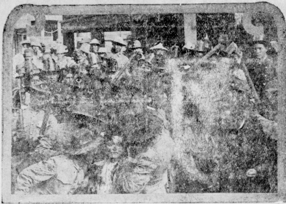
Scene from F. Bell Wright's Great Play, The Shepherd of the Hills at The Queen Theatre Tonight.

Ocular and reliable demonstrations are being made this afternoon to show that "The Shepherd of the Hills," the first legitimate play of the season in Ballinger, will top the record for advance seat sales for any play ever to open here. Several hundred reserved seats were bought before noon today, and shortly after the one o'clock whistle blew a run on the checking board began in earnest.