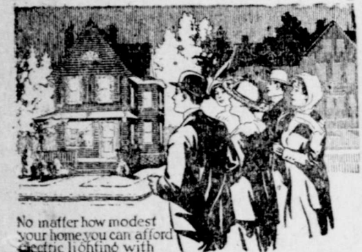
No matter how modest your home you can afford electric lighting with ADISON MAZDA LAMPS